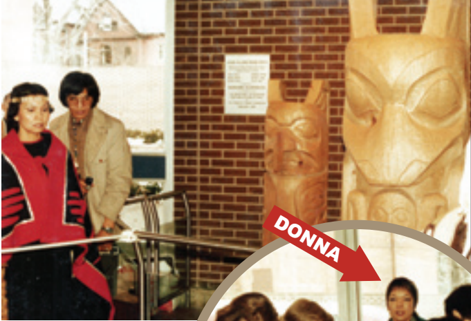
The dedication ceremony in 1979.