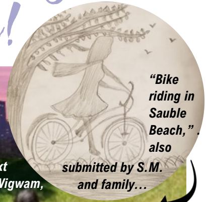
"Bike riding in Sauble Beach," also submitted by S.M. and family...