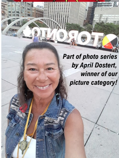
Part of photo series by April Dostert, winner of our picture category!