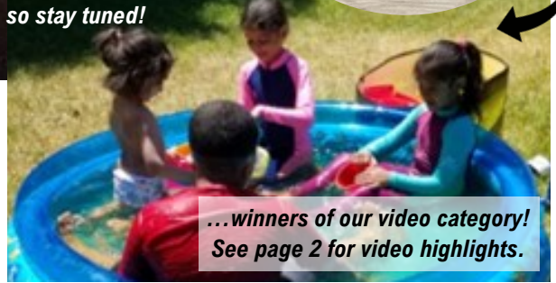
...winners of our video category! See page 2 for video highlights.