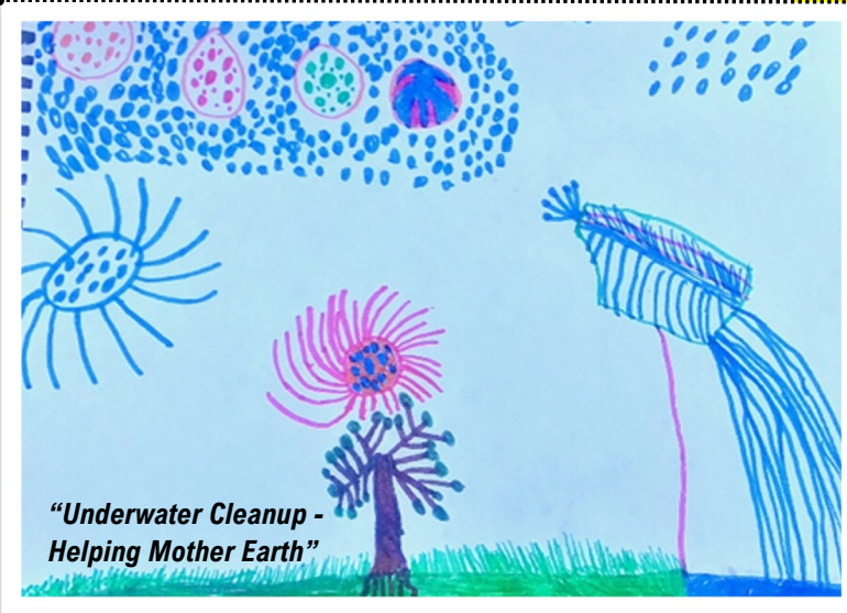
"Underwater Cleanup - Helping Mother Earth"