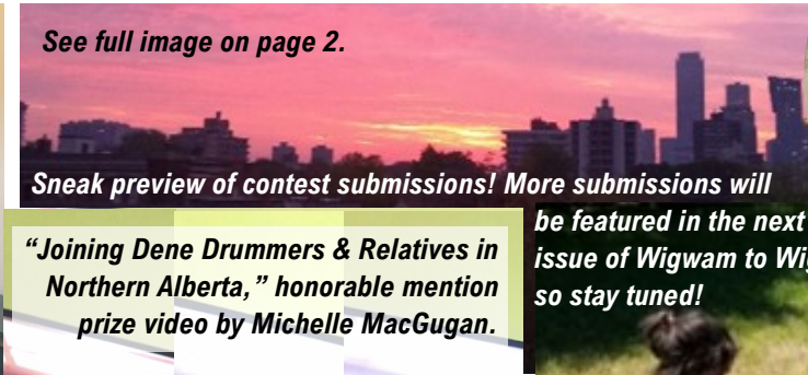
See full image on page 2.